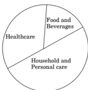
Table I. FMCG Products